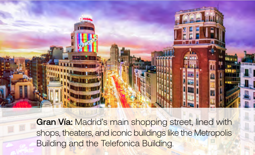
Gran Vía: Madrid's main shopping street, lined with shops, theaters, and iconic buildings like the Metropolis Building and the Telefonica Building.