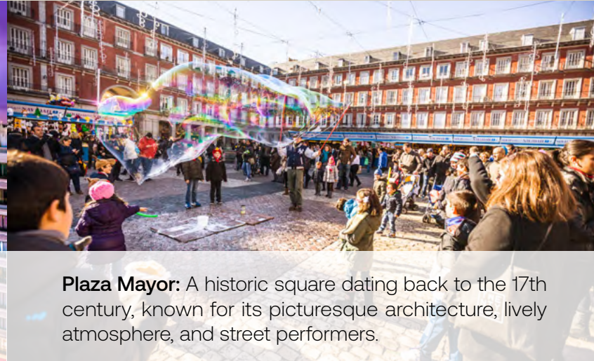
Plaza Mayor: A historic square dating back to the 17th century, known for its picturesque architecture, lively atmosphere, and street performers.