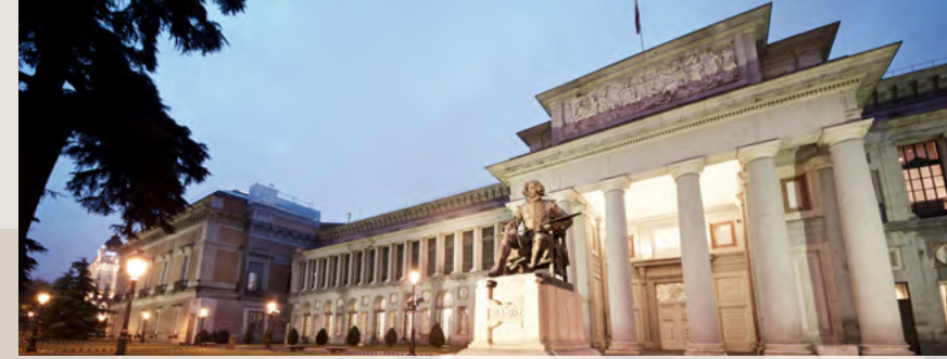
Prado Museum: One of the most renowned art museums in the world, housing an impressive collection of European art, including works by Velázquez, Goya, and El Greco.

Madrid is a vibrant city with a rich cultural heritage and plenty of attractions to explore.