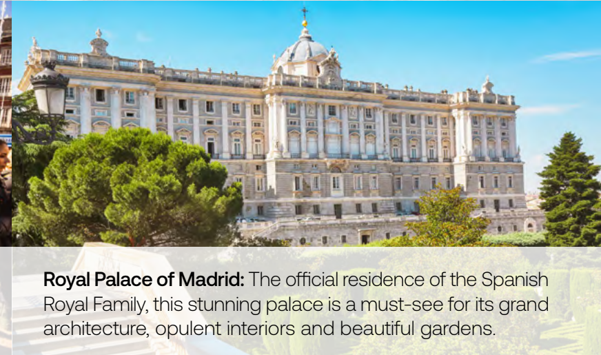
Royal Palace of Madrid: The official residence of the Spanish Royal Family, this stunning palace is a must-see for its grand architecture, opulent interiors and beautiful gardens.